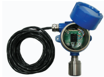
Shown with 10-0247 stainless steel sensor head

The 10-0411 Remote Sensor Kit allows smart sensors to be mounted up to 15 feet away from the SenSmart 7000 . SenSmart 7000 s may be configured as single or dual sensor monitors so either one or two 10-0411 Remote Sensor kits may be connected to each SenSmart 7000 . When combined with the 10-0247 Stainless Steel sensor head, the 10-0411 is suitable for Division 1 hazardous locations.